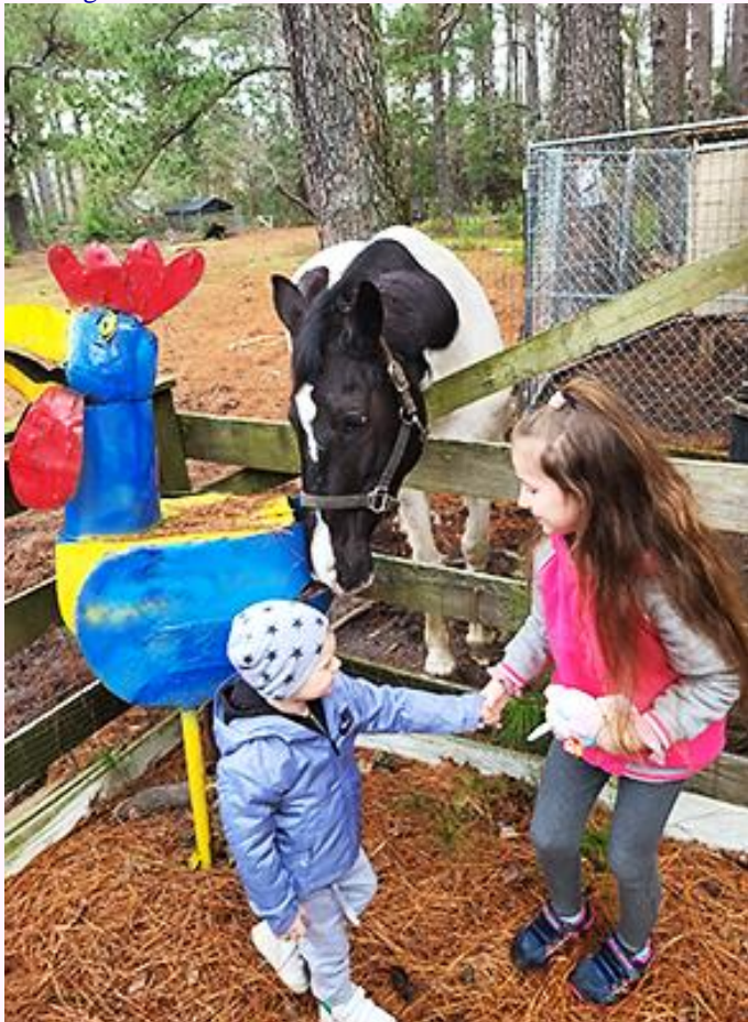
The children enjoy a visit to a horse farm.

that showed what a beautiful city Kyiv is. A photo of the young boy showed him and his dad watching cartoons by a kerosene lantern. They can't have too many lights on at night. I was texting back and forth when I realized it was 3 a.m. their time. I encouraged the young mother to get some rest, but she replied that she didn't sleep well at night because that was when the shelling occurred.